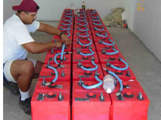
Typical small commercial battery bank.

Solar Electric Systems – Performance Building Consulting