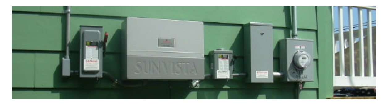
Pictured from left to right are the following solar electric system components of a grid tie system. 1) solar array manual disconnect (code required), 2) inverter, 3) A/C manual disconnect (required by net metering regulations), 4) distribution panel and 5) utility meter.