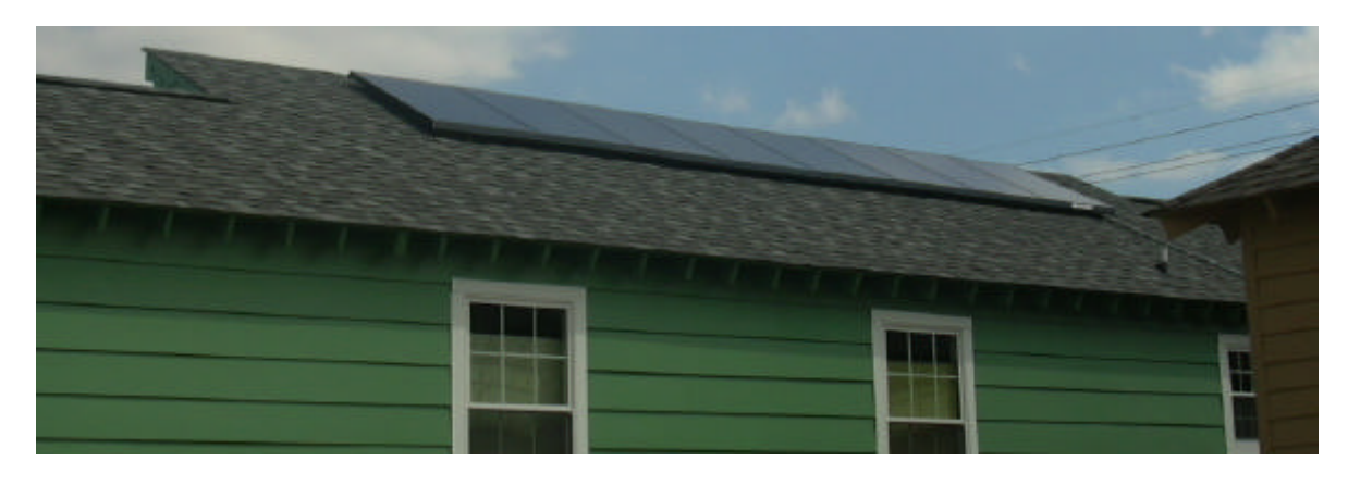
Pictured above is one of the 10 net metering solar energy systems recently installed in the Ninth Ward in New Orleans by Sharp Solar. The 1.5 KW (1,500 watt) solar array is composed of eight separate solar panels.

Line tie systems are designed to operate in parallel with the electric utility grid. They are the simplest and least costly system. Other than the solar panels themselves, the primary component in grid-connected solar electric systems is the inverter. The inverter converts the DC power produced by the solar array into AC power consistent with the power quality requirements of the utility grid, such as maintaining a constant voltage and frequency. The inverter also will shut down the solar should the grid lose power. A bi-directional interface is made between the solar electric system AC output circuits and the electric utility grid, typically at an on-site distribution panel or service entrance. This allows the AC power produced by the solar electric system to either supply on-site electrical loads or to back-feed the grid when the solar electric system output is greater than the on-site electric system output, the balance of power required by the loads is received from the electric utility grid.