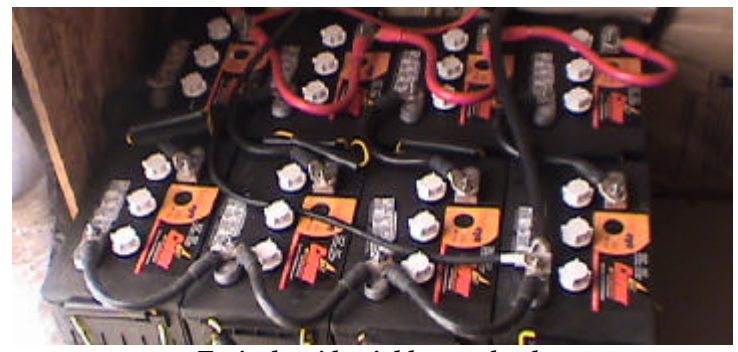
Typical residential battery bank.

The cost of line tie systems with battery backup vary greatly depending on the battery technology and size of battery bank installed. As a general rule, the addition of a battery bank and charge controller to a line tie system will increase system cost by $2 to $10 per watt. Thus, the 10 kW, $85,000 line tie system described above could double in cost by adding battery backup. The addition of a battery bank will also affect long-term economics since a battery requires on-going maintenance and occasion replacement.